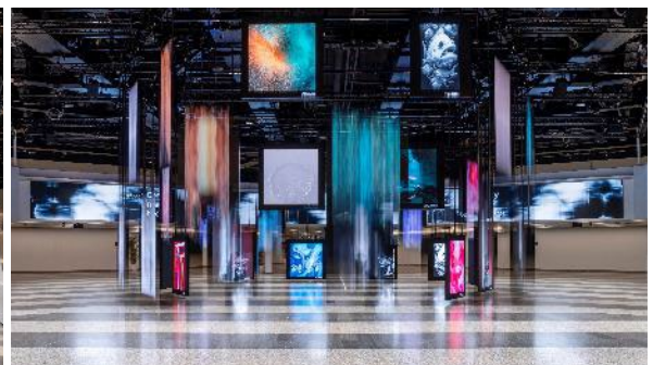
Dynamic art exhibition