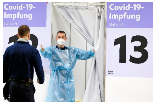
The Austria Center Vienna is currently Austria's largest testing and vaccination facility